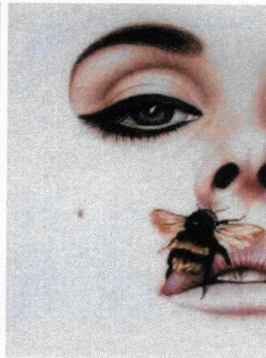
Lana Del Rey Fan Art

If you are using collaged images the work submitted must include substantial changes to the original work. Changing the medium or adjusting color does not transform the original source material.