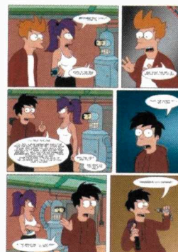
Futurama Fan Art